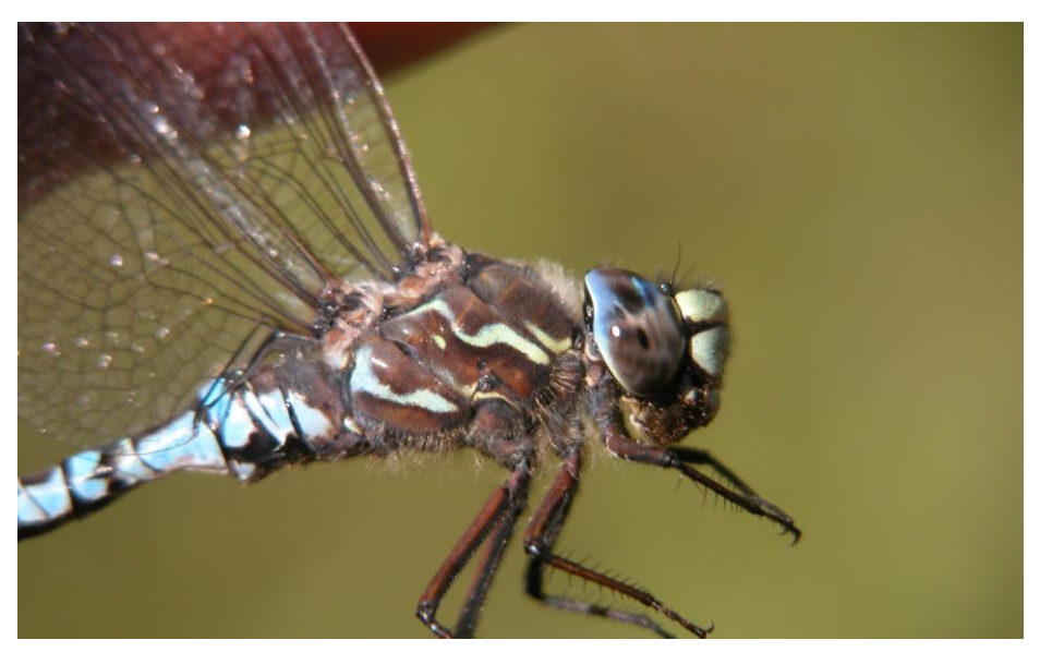
Subarctic Darner - Aeshna subarctica

Riverine habitats in June provide exciting Odonating due to the large variety of Clubtails flying then. Many of these species are uncommon to rare and, like trout, can be devastated by erosion, siltation and increased water temperatures. The majority of the dragonflies of "special concern" in Minnesota are river denizens and not much is known about which species are living where in the state.